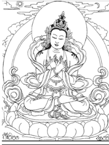
Homage to Dorje Chang