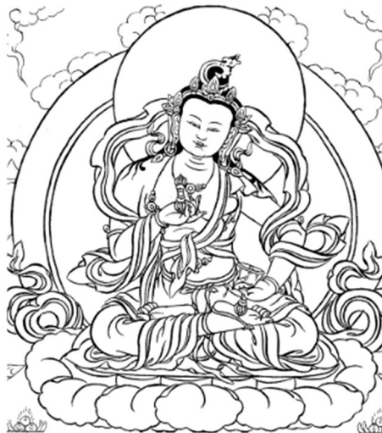
Homage to Naropa