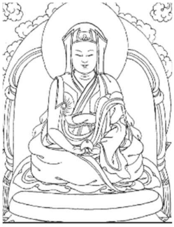
Homage to Gampopa