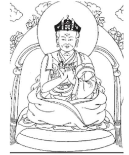
Homage to Dusum Khyenpa (1st Karmapa)