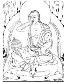
Homage to Milarepa