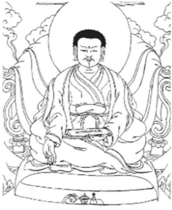
Homage to Marpa