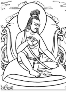
Homage to Tilopa